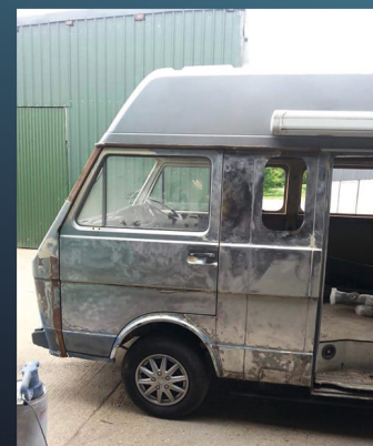
Put some clothes on girl!