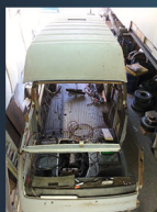
Up, up & away!