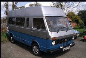
The van when she first arrived