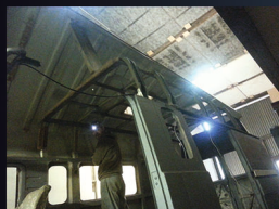
Raising the roof