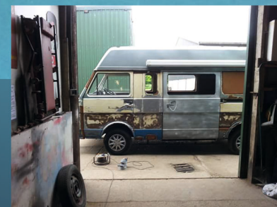
Stripping down for spraying