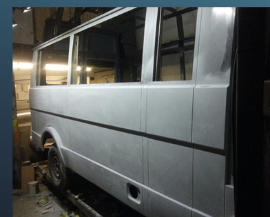
Nothing like seeing the first new layer go back on